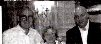
At Right: Operation Promise vice-